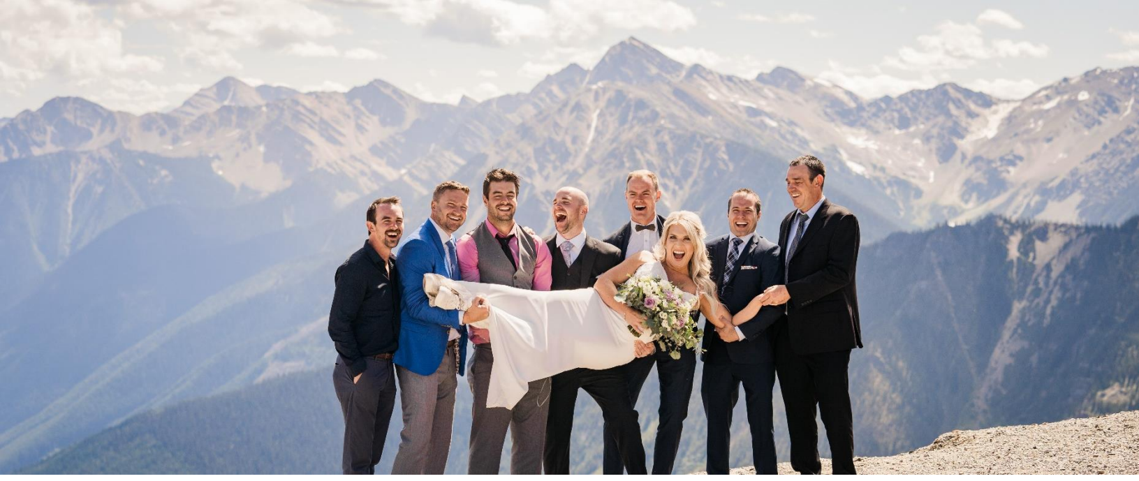
Tara Hill Studios