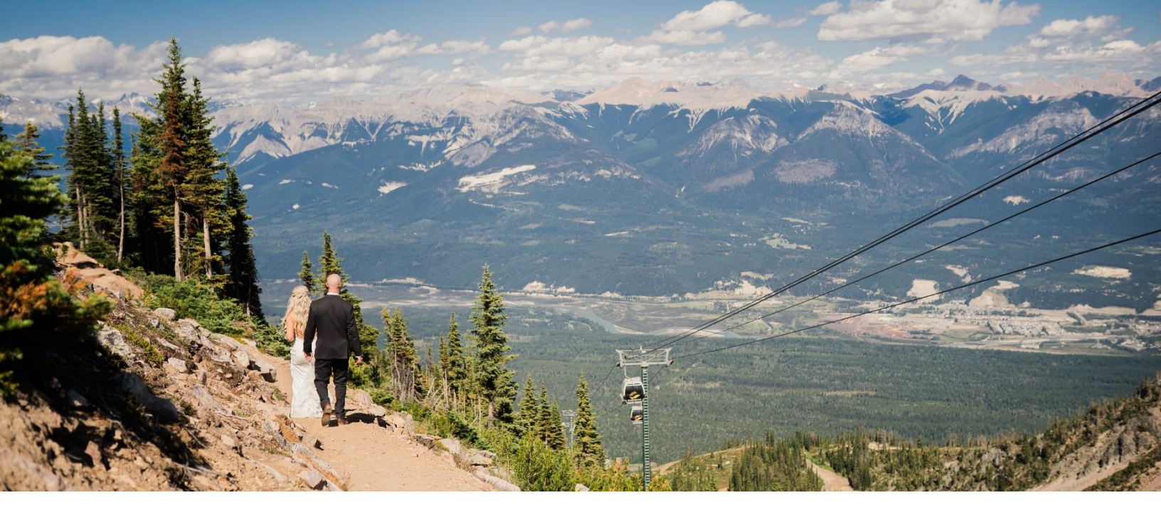
Tara Hill Studios