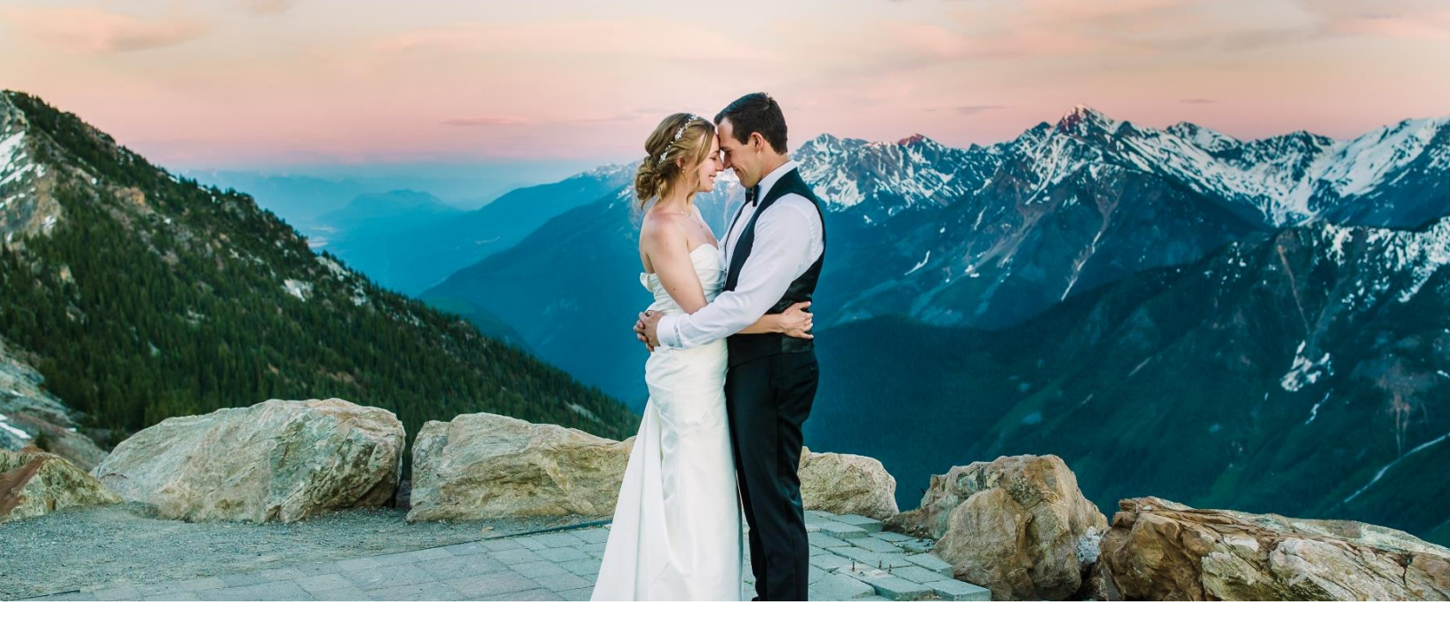
Northern Pixel Photography