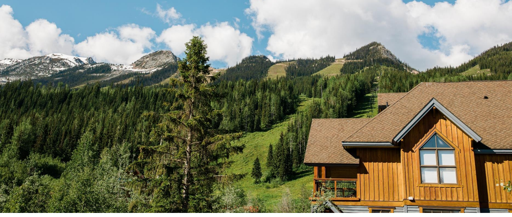
Northern Pixel Photography