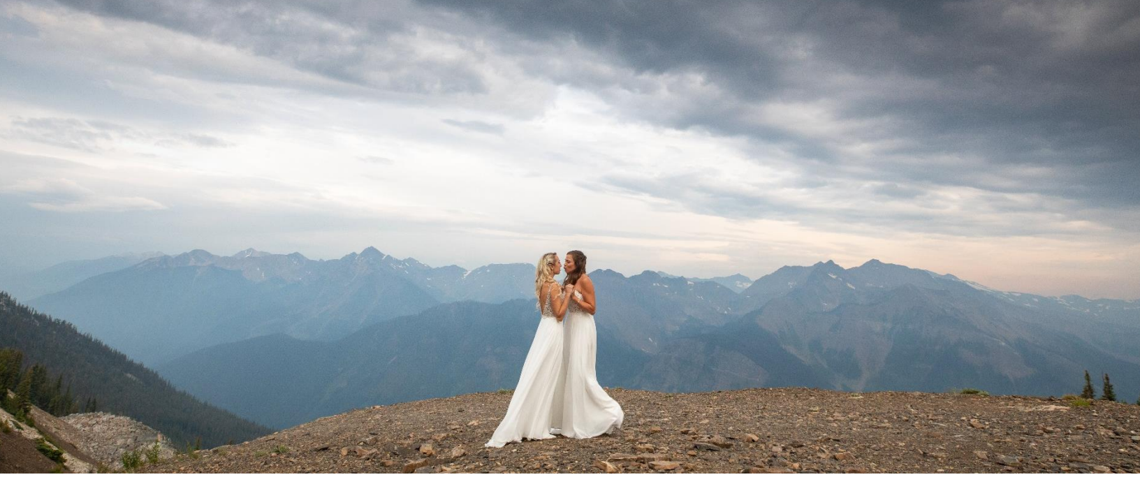
Eric Daigle Photography