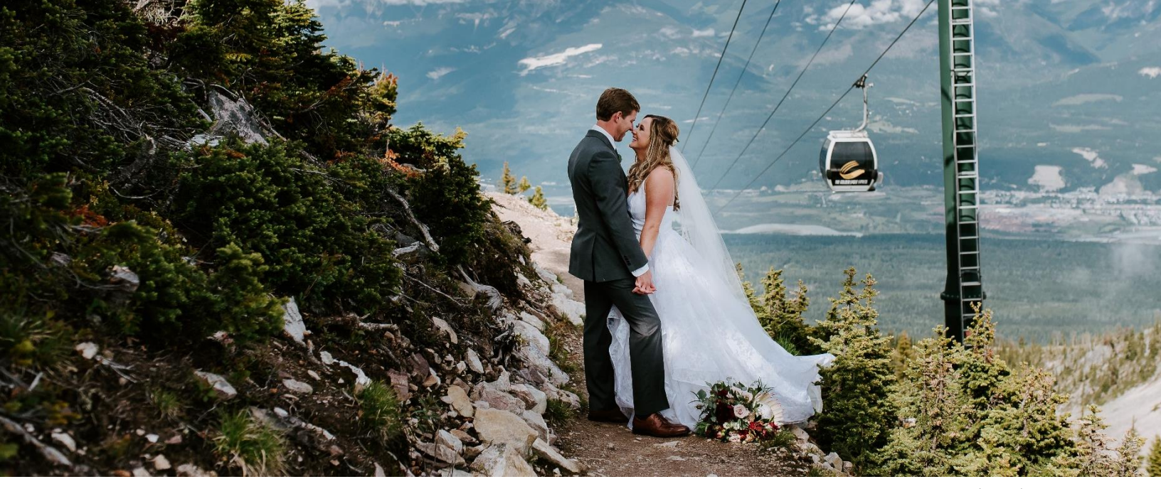
Morgan Cox Photograph